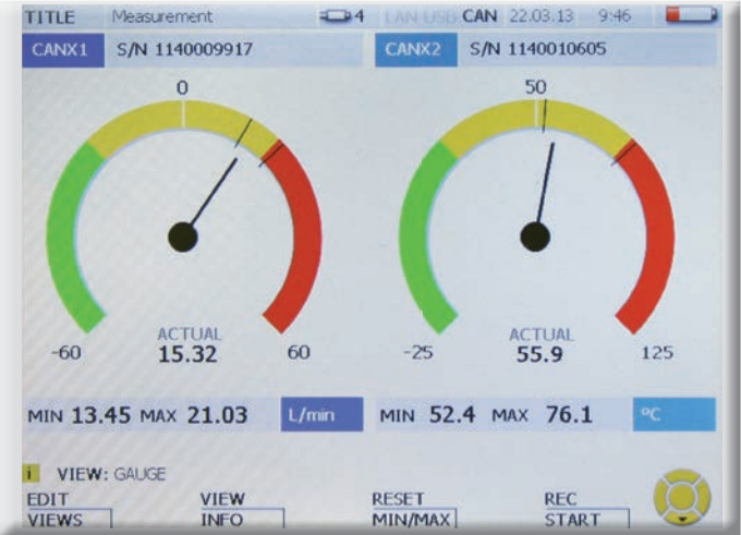
Typical screen shots taken from the HPM6000

Initially a 30 day test, the test was then increased to one hundred days and had been running for nine months at its conclusion at the end of January 2015. The test has proved to be a total success for the structural design of the assembly, fully supported by the results captured by the Webtec HPM6000 data logger.