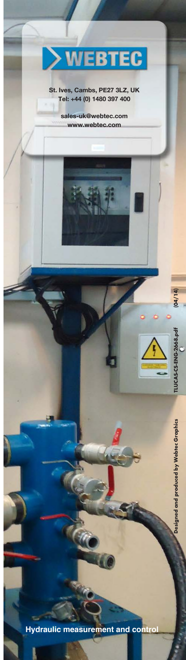
Hydraulic measurement and control

TALLERES LUCAS LTDA ventas@tallereslucas.cl / servicio@tallereslucas.cl For further details on the C2000 please contact sales@webtec.co.uk